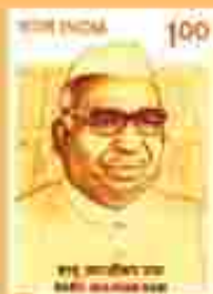
Jagjivan Ram (1908-1986): Freedom fighter and Congress leader from Bihar. Deputy Prime Minister of India (1977-79), member of Constituent Assembly, also a Member of Parliament since 1952 till his death. Labour Minister in the first ministry of free India; held various other ministries from 1952 to 1977, a scholar and astute administrator.

The opposition to Emergency could keep the Janata Party together only for a while. Its critics felt that the Janata Party lacked direction, leadership, and a common programme. The Janata Party government could not bring about a fundamental change in policies from those pursued by the Congress. The Janata Party split and the government which was led by Morarji Desai lost its majority in less than 28 months. Another government headed by Charan Singh was formed on the assurance of the support of the Congress party. But the Congress party later decided to withdraw its support with the result that the Charan Singh government could remain in power for just about 4 months. Fresh Lok Sabha elections were held in January 1980 in which the Janata Party suffered a comprehensive defeat, especially in north India where it had swept the polls in 1977. Congress party led by Indira Gandhi nearly repeated its great victory in 1971. It won 353 seats and came back to power. The experience of 1977-79 taught another lesson in democratic politics: governments that are seen to be unstable and quarrelsome are severely punished by the voters.