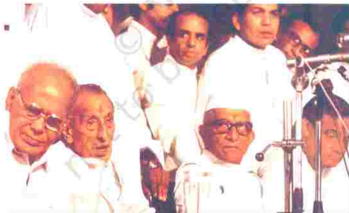
Oath taking by the first non-congress government at the centre in 1977. In the picture are Jayaprakash Narayan, J. B. Kriplani, Morarji Desai and Atal Behari Vajpayee.

The Janata Party government that came to power after the 1977 elections was far from cohesive. After the election, there was still competition among three leaders for the post of Prime Minister – Morarji Desai, who was the rival to Indira Gandhi ever since 1966-67; Charan Singh, leader of the Bharatiya Lok Dal and a farmers' leader from UP; and Jagjivan Ram, who had vast experience as a senior minister in the Congress governments. Eventually Morarji Desai became the Prime Minister but that did not bring the power struggle within the party to an end.