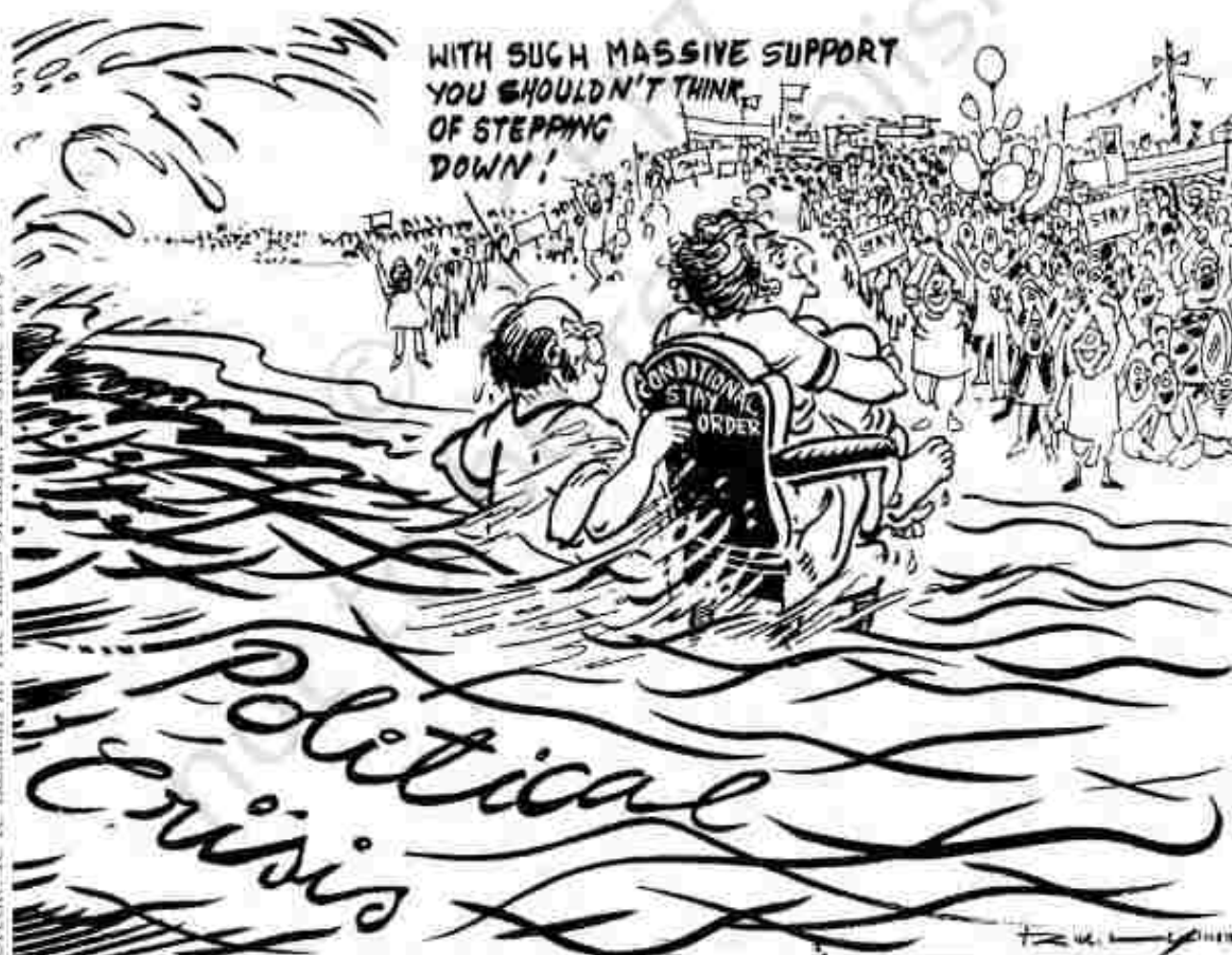
This cartoon appeared few days before the declaration of Emergency and captures the sense of impending political crisis. The man behind the chair is D. K. Barooah, the Congress President.

Once an emergency is proclaimed, the federal distribution of powers remains practically suspended and all the powers are concentrated in the hands of the union government. Secondly, the government also gets the power to curtail or restrict all or any of the Fundamental Rights during the emergency. From the wording of the provisions of the Constitution, it is clear that an Emergency is seen as an